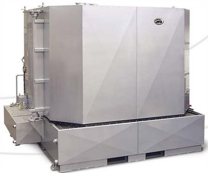
Access to the turntable allows for ease of loading from overhead

Visit www.jriindustries.com or contact JRI Industries at 417.866.8855 for a complete range of Heavy Duty Parts Washers and Options.