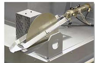
Stainless Steel Oil Skimmer