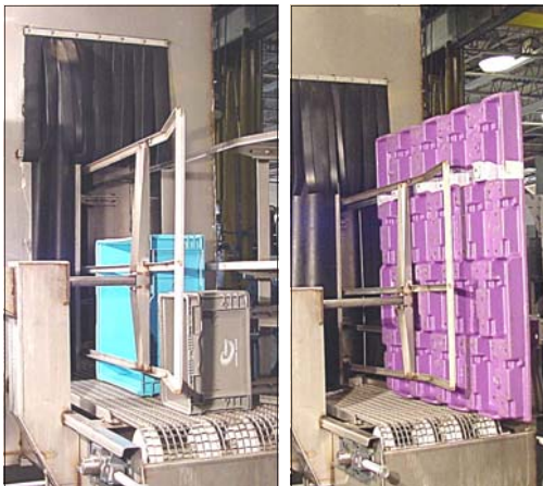
Adjustable guides for boxes and trays