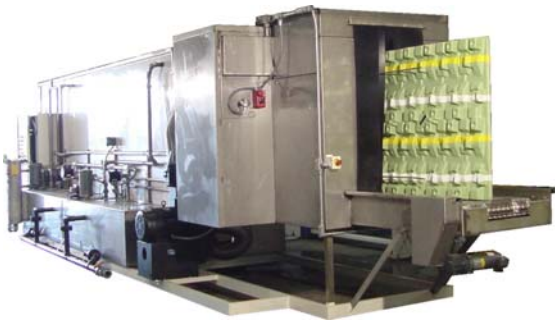
High Volume Dunnage Tray washer