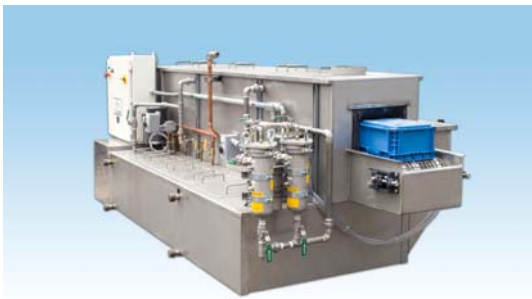
Belt conveyor Tote and Box spray washer

JENFAB has been building Dunnage and Tote washers for over forty five years. These parts washers are designed to remove coolants, lubricants, chips, wax films and road dirt from all size and shape steel and plastic dunnage. Our experience has lead to the development of the most efficient machines designed to run 24/7 and meet any cleaning and drying specification. These machines conserve energy, save floor space and minimize water usage