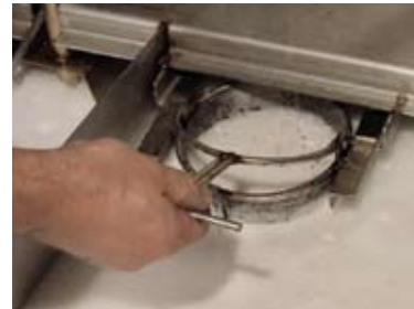
Optional Chip Strainer Baskets easily lift out and keep chips out of tank